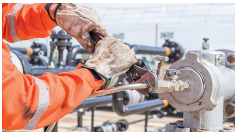
During field maintenance of pumps, valves, and generators