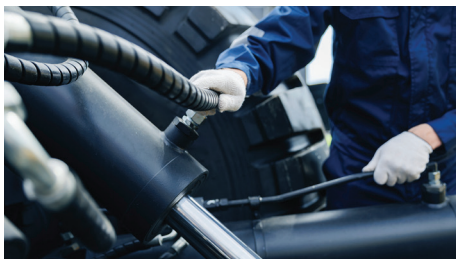
During storage or maintenance for gas-powered or hydraulic tools