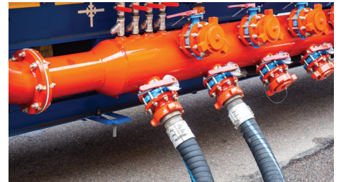
Contain spills during fluid transfers