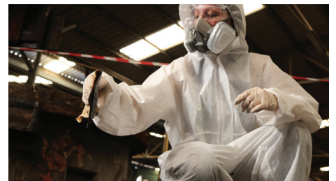
For rapid deployment for leaking containers during spill cleanup operations