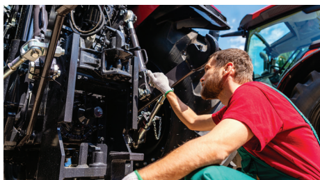
During oil changes, filter replacements, and under-vehicle spill containment, including roadside service truck applications