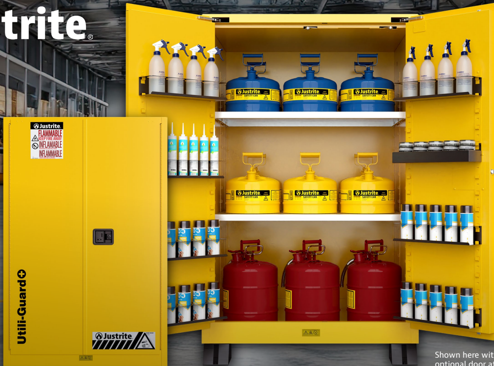
Shown here with 6 additional optional door attachments and optional skid legs