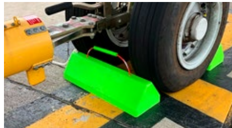
CAC24-QLR securing A320 nose gear.