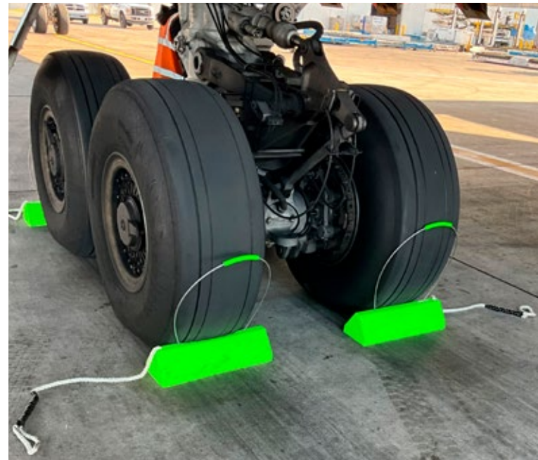
CAC24-QLR-ECH securing 747-400 (cargo) main gear.