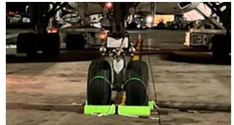
CAC24-QLR-ECH securing 777 nose & main gear at night.