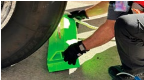
Easy to place & remove on all sizes of aircraft.