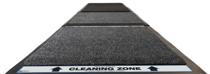
3-Zone Shoe Sanitizer System (cleaning, disinfecting, drying)