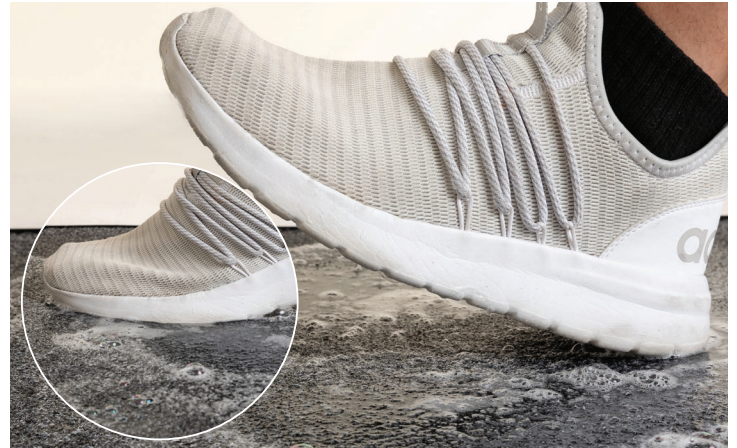
Rock feet back and forth to push cleaning solution into shoe treads.