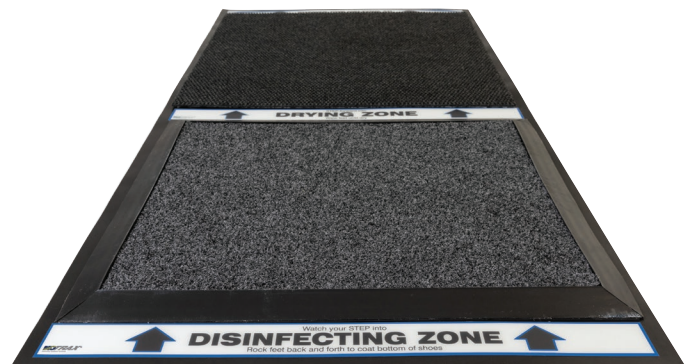
2-Zone Shoe Sanitizer System (disinfecting, drying)