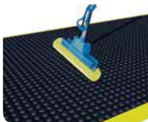
Damp-mop top surface periodically