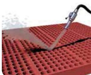
Water jet with soap daily