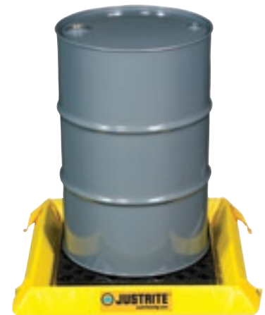
28400 with 1642S optional grate