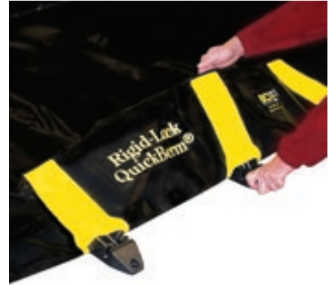
A simple tug locks supports in upright position.