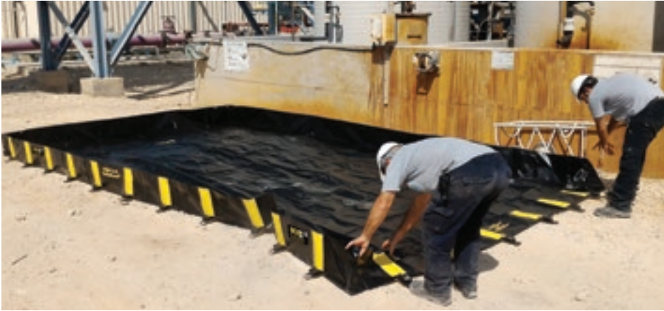
No assembly needed—saves time, ready in minutes!